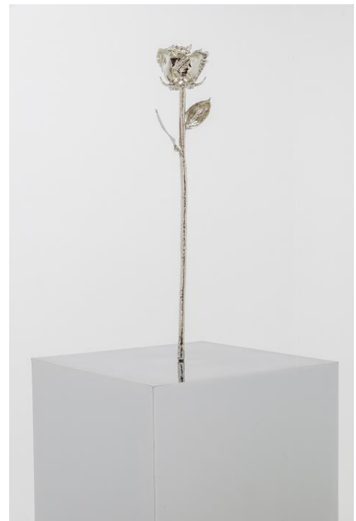
Margaret Lee Do You See What I See (Banana and Rose) (detail: rose) , 2014 Steel, chrome, plastic, platinum rose, and alpaca fur Two pedestals each: 16 x 16 x 57 in. (40.64 x 40.64 x 144.78 cm) Courtesy of the artist and Jack Hanley Gallery © Margaret Lee Photo Credit: Joshua White