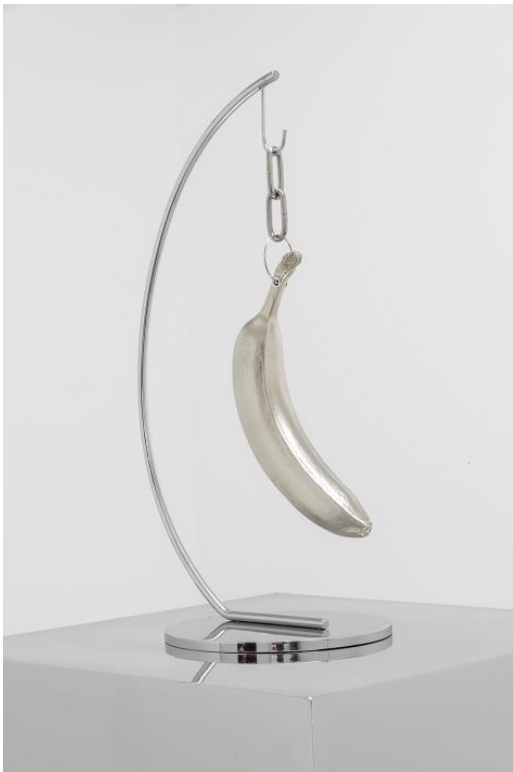
Margaret Lee Do You See What I See (Banana and Rose) (detail: banana) , 2014 Steel, chrome, plastic, platinum rose, and alpaca fur Two pedestals each: 16 x 16 x 57 in. (40.64 x 40.64 x 144.78 cm)