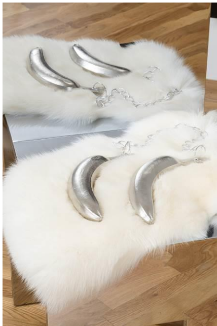
Margaret Lee It Usually Stands Alone (Bananas) (detail), 2014 Aluminum, plastic, chrome, fox fur, steel, and powder coat Chair: 14.5 x 16.125 x 29.25 in. (36.83 x 40.96 x 74.30 cm) Grid: 58 x 72 x 2 in. (147.32 x 182.88 x 5.08 cm) Courtesy of the artist and Jack Hanley Gallery © Margaret Lee Photo Credit: Joshua White