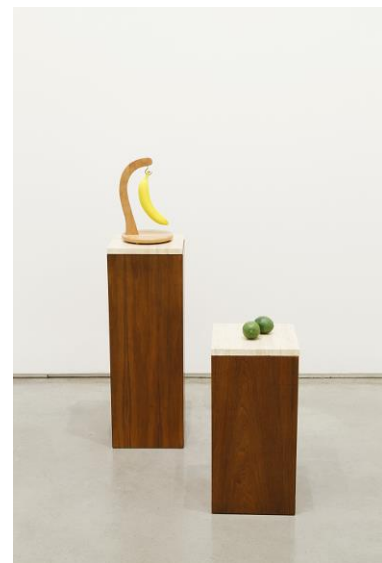
Margaret Lee Hanging Banana and Two Limes , 2013 Two pedestals, plaster, acrylic paint and banana stand Overall: 40 x 38.5 x 14 inches (101.6 x 97.79 x 35.56 cm)