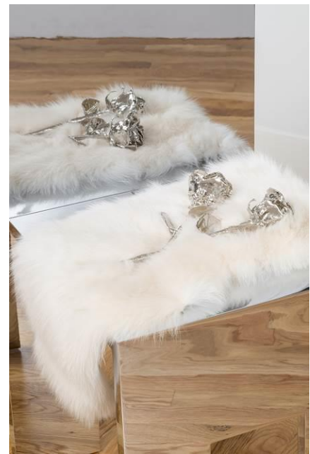
Margaret Lee It Usually Stands Alone (Roses) (detail), 2014 Aluminum, platinum roses, chrome, fox fur, and powder coat Chair: 14.5 x 16.125 x 29.25 in. (36.83 x 40.96 x 74.30 cm) Grid: 58 x 72 x 2 in. (147.32 x 182.88 x 5.08 cm)