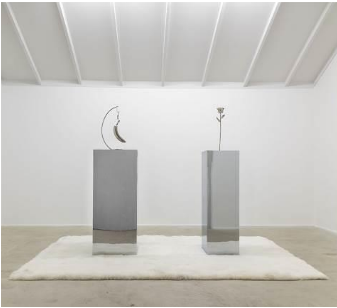
Margaret Lee Do You See What I See (Banana and Rose) , 2014 Steel, chrome, plastic, platinum rose, and alpaca fur Two pedestals each: 16 x 16 x 57 in. (40.64 x 40.64 x 144.78 cm) Courtesy of the artist and Jack Hanley Gallery © Margaret Lee Photo Credit: Joshua White